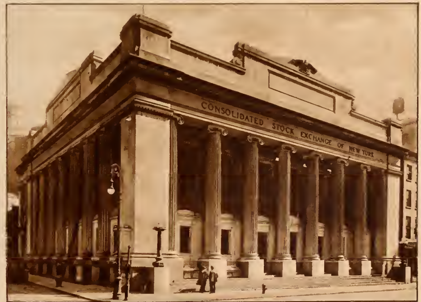
CONSOLIDATED STOCK EXCHANGE.